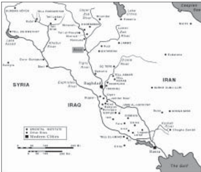
Mesopotamia, 2700 years ago

One of the first recorded incidents was in Mesopotamia, by the city-state Assyria [see map, below left]. The Assyrians employed rye ergot, an element of the fungus Claviceps purpurea , which contains mycotoxins. [2-3] Rye ergot was used by Assyria to poison the wells of their enemies, with limited success. Hellebore, a plant with powerful purgative and cardiac glycoside effects, was also used by the Greeks to poison the water supply during their siege of the city of Krissa. [2-3]