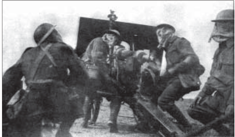
WWI gas masks

Direct assaults with chemical agents such as nitrogen mustard, phosgene, and chlorine gas were much more effective, inflicting morbidity and mortality on hundreds of thousands of troops during the war [photo, right]. As a result, the Geneva Protocol was signed by thirty-eight countries in 1925, prohibiting the use, but not research or production, of chemical and biological weapons. [4]